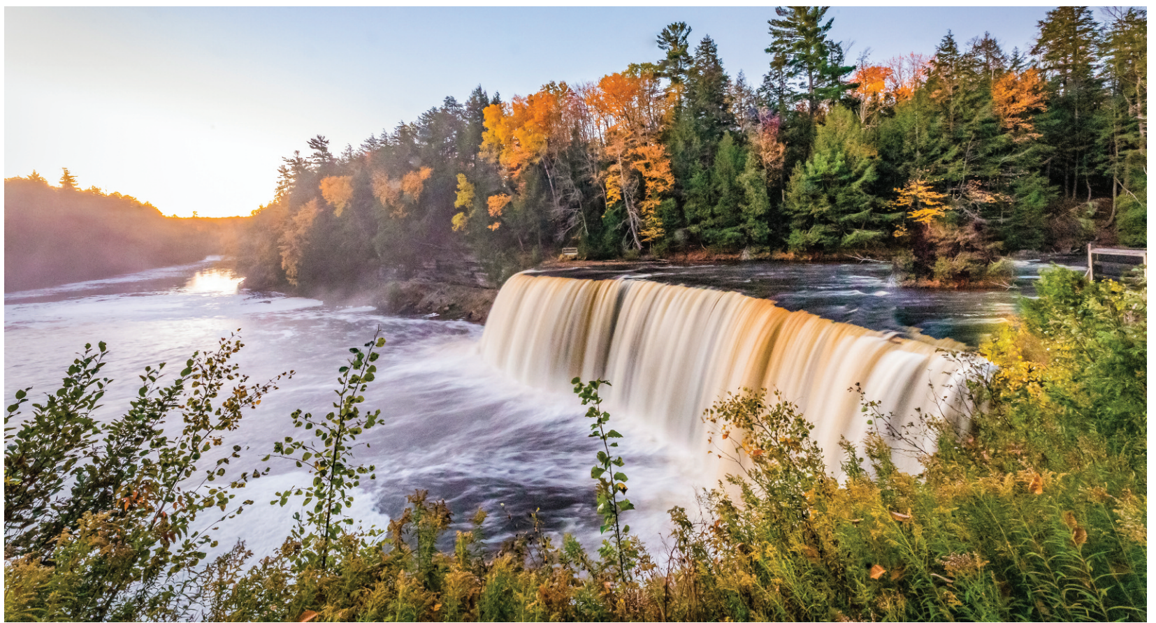
The Upper Falls at Tahquamenon Falls State Park in Paradise, Michigan. This photo is part of the DNR's Michigan state parks photo ambassador program.

Located in Michigan's Upper Peninsula in a town called (what else?) Paradise, Tahquamenon Falls State Park is best known for its showcase waterfalls. The Upper Falls is one of the largest waterfalls east of the Mississippi River, and the Lower Falls, just 4 miles downstream, is a series of five smaller waterfalls that cascade around the island. View the waterfalls and vibrant fall foliage from the