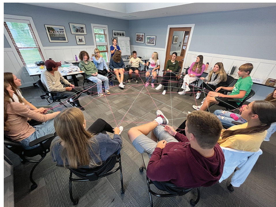
SEE ADVISORY COMMITTEE - 5A