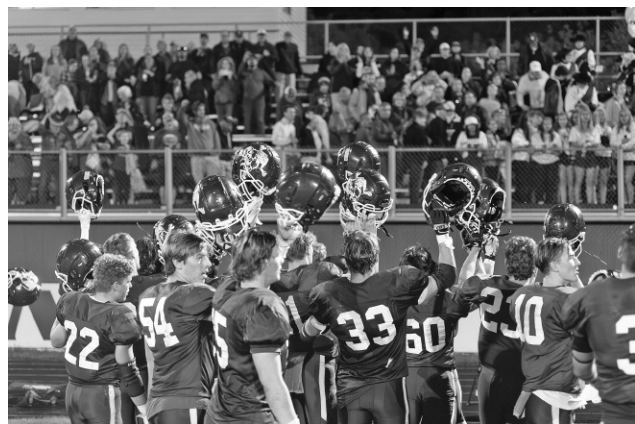
Charlevoix players salute home crowd.