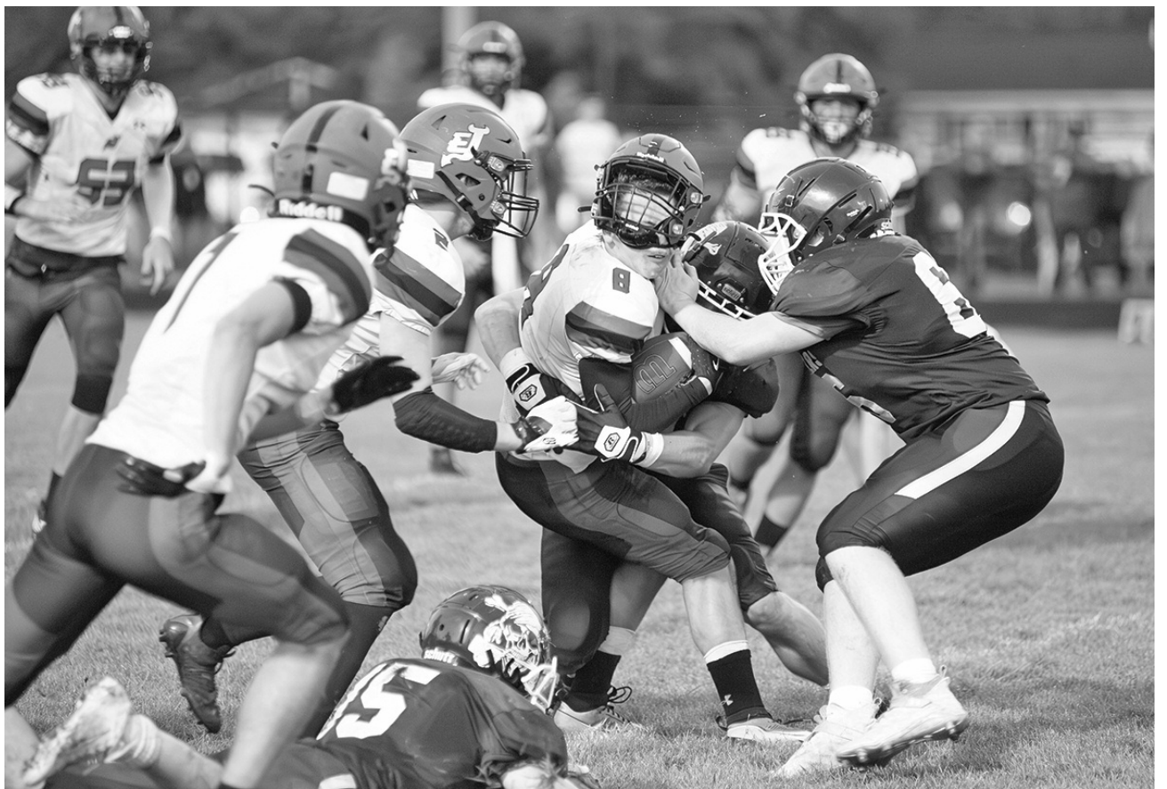
#63 for Charlevoix halts East Jordan's progress in the third quarter.