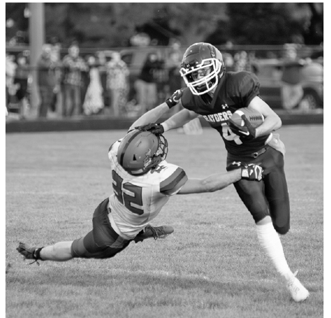
#4 sheds a tackle by Red Devil #32 for a gain in the first half.

MODEL YEAR CLOSEOUT SALE! THURS-SAT • SEPT. 21-23