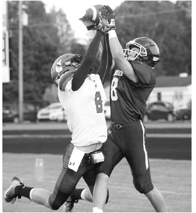
A pass intended for Charlevoix's #8 is broken up by the defender.