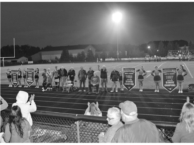
Boyne City honored members of the 1956, 1957 State Champion Football teams and the 1957, 1958 State Champion Track Teams.